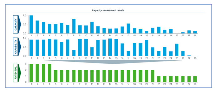
Figure 2 Capacity assessment results.

In an interim analysis of 28 out of 40 hospitals, hospitals were segmented into three groups (0–100% ratio scale) based on their readiness, determined by their capacity and capability. Four hospitals were included in segment A, 17 in segment B and 7 in segment C.