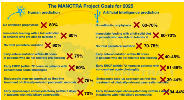
FIGURE 2. The MANCTRA project goals for 2025.

Twelve articles were analyzed, of which 7 were systematic reviews with meta-analyses of RCTs, 4 were systematic reviews and meta-analyses of RCTs and n-RCTs, and 1 RCT.