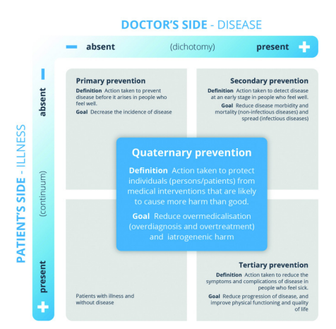
Figure 2 Quaternary prevention: the new definition and the new ramework. From: Martins C, Godycki-Cwirko M, Heleno B, et al. Quaternary prevention: an evidence-based concept aiming to protect patients from medical harm. Br J Gen Pract 2019. doi: 10.3399/bjgp19X706913. Used with permission.

movement proposes that P4 be redefined as 'Action taken to protect individuals (persons/patients) from medical interventions that are likely to cause more harm than good'.<sup>12</sup> This broadens the application of P4 from only people who feel sick but do not have measurable pathological processes, to any person in contact with healthcare. As illustrated in figure 2, it incorporates the need for evidence-based clinical practice and understanding of the patient's goals and experiences and asserts that each medical intervention must be analysed according to this paradigm.<sup>13</sup> <sup>14</sup> Precision medicine, which is also sometimes abbreviated as 'P4' to convey that it is predictive, preventive, personalised and participatory, is distinct and may even be in opposition to the approach of quaternary prevention (P4).<sup>15</sup> We refer only to the latter in our study.