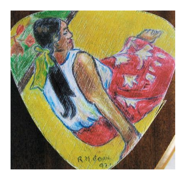
Fig. 1. Painting 1 (1997; 60 years). Crayon drawing. Steady and sure hand, with no tremor. Colors are well balanced, and the figure is well proportioned. Close-up drawing, neglecting the background.

Table 1. Medication (mg/24 h) of the patient from the age of 54 to 74 years