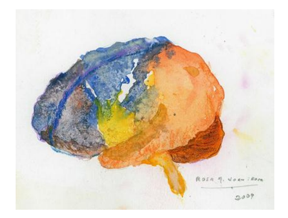
Fig. 3. Painting 3 (2009; 72 years). Watercolor. Different colors are used on a white background, regardless of the depth or the perspective of the figure.