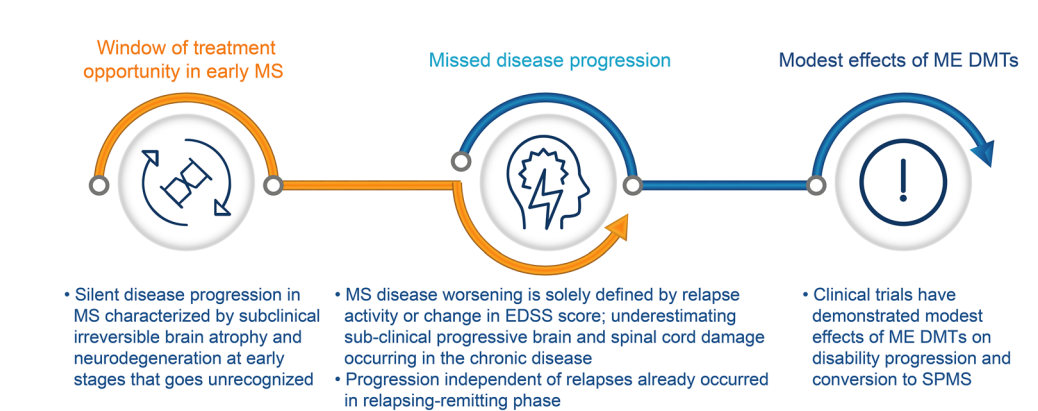
Fig. 2 Different factors highlighting the need for early initiation of HE DMTs in PLwMS. EDSS Expanded Disability Status Scale, DMT diseasemodifying therapy, HE high efficacy, ME moderate efficacy, MS multiple sclerosis, NEDA no evidence of disease activity, PLwMS people living with MS, SPMS secondary progressive MS

Composite outcome measures (NEDA) are unable to predict long-term outcomes in disease progression